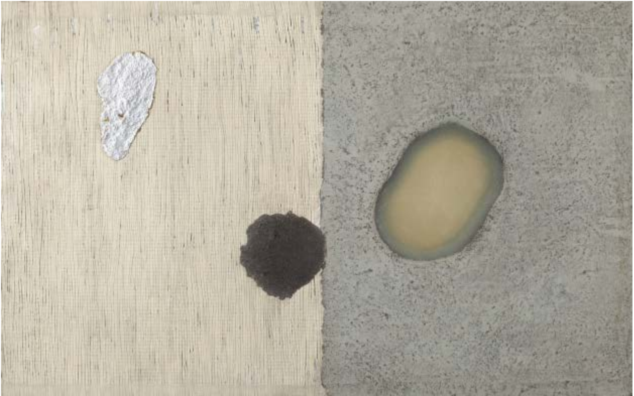
Art work by Park Sang Nam

What makes this exhibition unique is the varied choice of media. The juxtaposition of the 29 artworks, created using materials as diverse as steel, Korean paper, oil paints, and acrylic, are the perfect starting point for exploring refreshing new angles in Korean contemporary art.